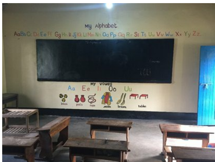
Finished Class rooms

We joined a support group for children with HIV, known as “Jaja’s group.” We learnt that most children who live with HIV have no parents and are often looked after by their “Jajas” (Grandmothers). The group provides the children with medical treatment, meals, social and spiritual support. We started our time together with worship followed by breakfast. We spent the rest of our morning playing with bouncy balls, bubbles, loom bands and Lego that we had brought from the UK. We also supported the children to