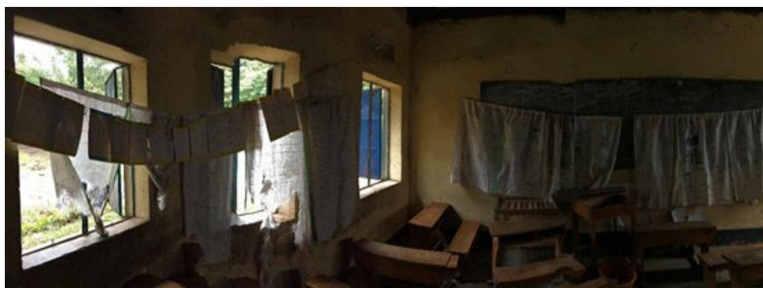
The Class rooms before we started any work

Upon arrival at the school we were shocked at the condition of the classrooms which had walls caked in dirt, and rice sacks re-purposed as teaching aids stuck to the wall. We repaired and painted some of the classrooms that needed some refurbishment. Firstly, we repaired the windows and doors, so the classroom could be secured; we also installed lighting and mounted clocks. We commissioned local artists to decorate the classrooms with things such as number lines, maths conversion charts and literacy displays. This made the classroom a more pleasant and functional learning environment for the children.